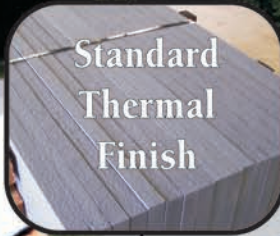
Standard Thermal Finish